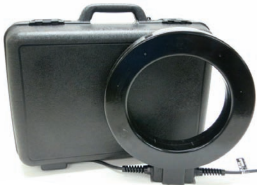
PL-10 with Case

For the correct and safe use of this equipment, proper training of operating personnel to required inspection techniques, specifications and safety requirements is necessary, and is the obligation of the user.